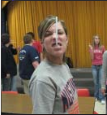
Spew the Chew