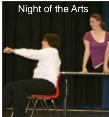
Night of the Arts