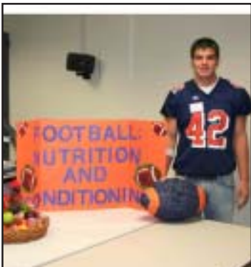
Senior Project Day