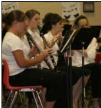
Night of the Arts