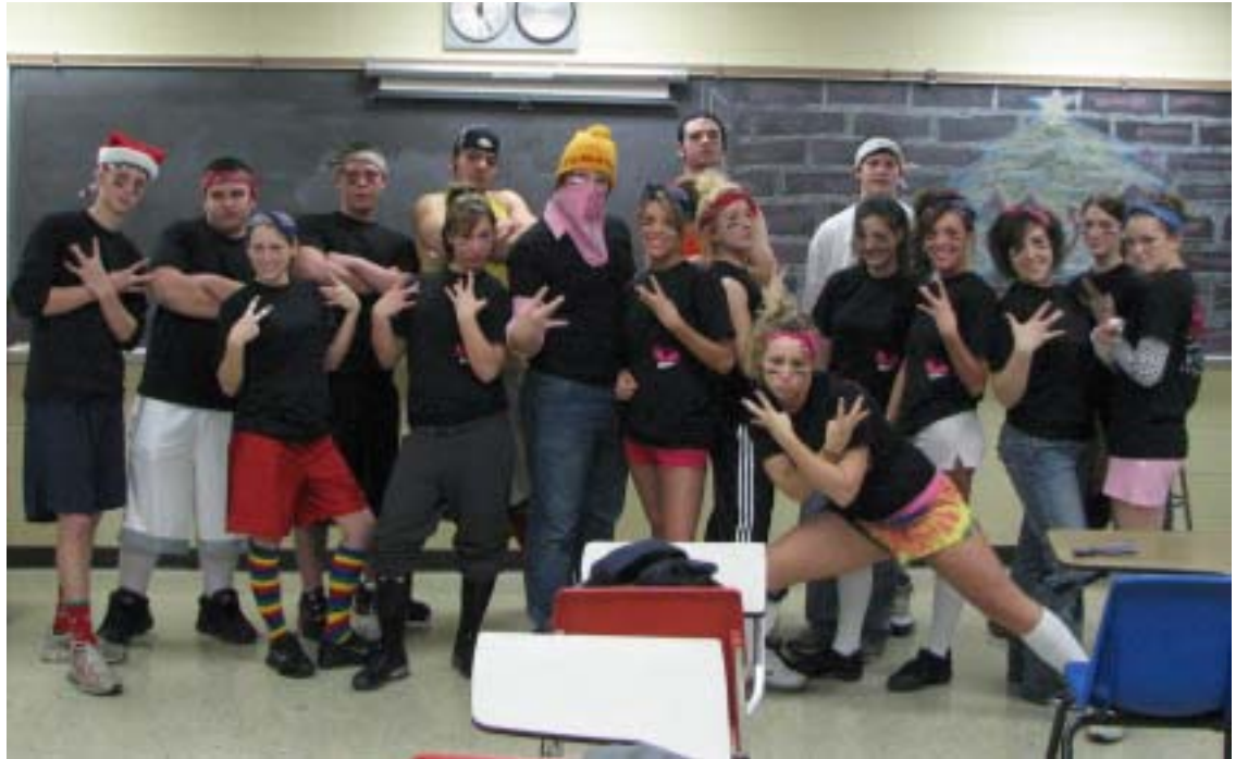
The senior class tries to intimidate the competition before the dodgeball tournament.

down the "tunnel of darkness" and had to be dug out with a really long pole. Another day, the girls in the class hid the entire class period from the teacher. They also T.P.'ed the boys' locker room.