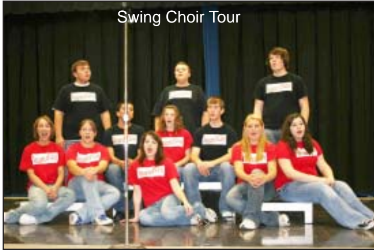
Swing Choir Tour