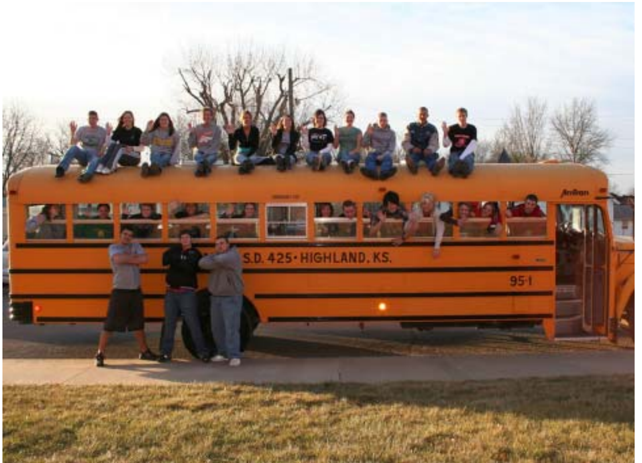
The Class of 2007 waves goodbye to their final high school year as they prepare to begin a new journey through life. After spending a lot of time in the halls of Doniphan West High School and making many lasting memories together, they are finally ready to walk out of the doors on their own.