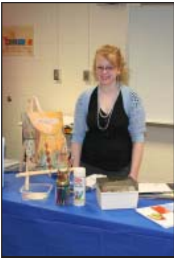
Senior Project Day