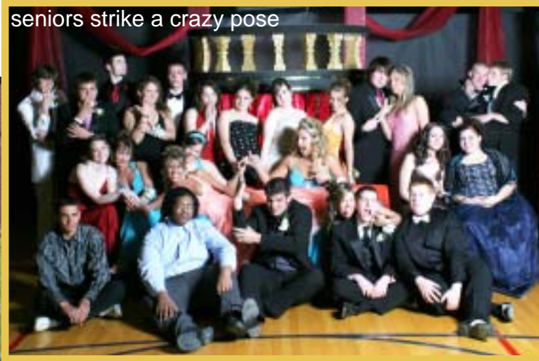
seniors strike a crazy pose