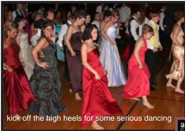
kick off the high heels for some serious dancing