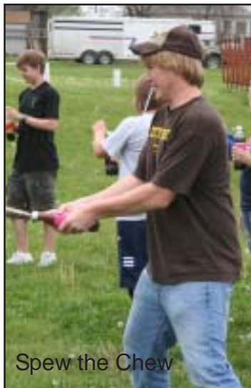
Spew the Chew