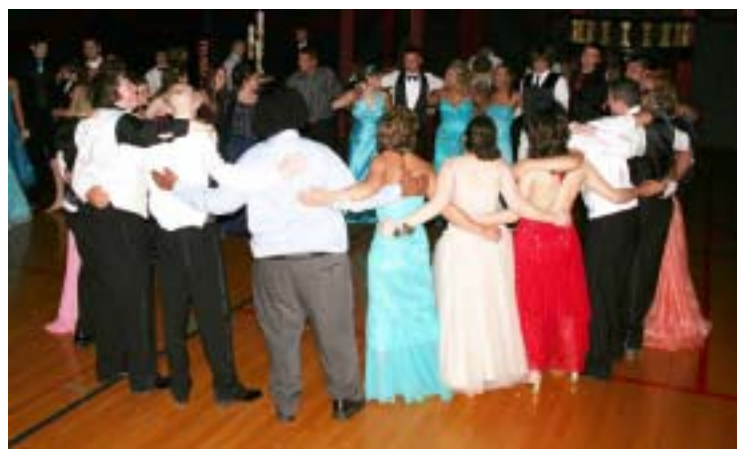
The seniors dance their last dance together at prom to "Total Eclipse of the Heart."